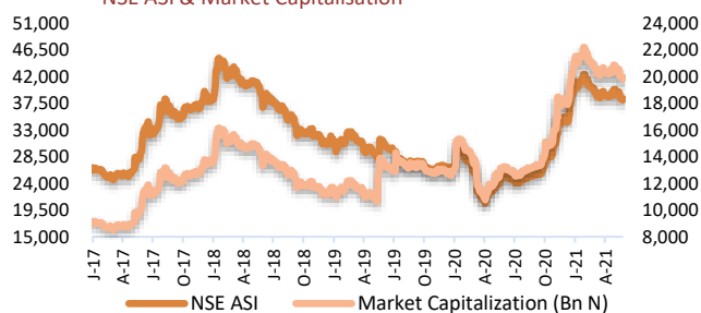
NSE ASI & Market Capitalisation

Investors in the Nigerian equities market today cashed in N40.42 billion as the All-Share Index revved by 0.18% to close above 42,000 points amid sustained bargain hunting activity. Also, the Exchange registered a strong number of gainers (32), against few losers (19), as corporates round up on filing their 9Months financial statements on the local bourse today. TOTAL, OKOMUOIL, GUINNESS, WAPCO and VITAFOAM shares were the toast of investors today as the appreciation in their share prices chiefly lifted the year-to-date gain of the local bourse to 4.39%. Bullish trend was also sustained across sub-sectors tracked, except for the NSE Consumer Goods index which closed lower (0.42%). The NSE Banking, NSE Insurance, NSE Oil/Gas and the NSE Industrial indexes increased by 1.23%, 1.47%, 2.10% and 0.34% respectively. Elsewhere, market transactions increased sharply today as the volume and value of stocks traded ballooned by 102.14% and 212.85% to 1.13 billion units and N13.78 billion respectively on significant sale of Eterna shares. Meanwhile, NIBOR, NITTY fell for most tenor buckets tracked on renewed financial system liquidity ease. In the OTC bonds market, the values of FGN bonds traded moved in mixed directions across maturities tracked. However, the value of FGN Eurobond fell further for all maturities tracked amid sustained sell pressure.